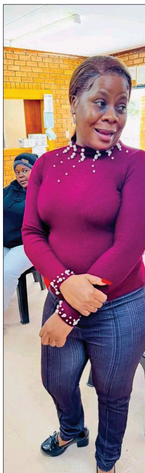
MEC for Health in Limpopo, Dieketseng Mashego, during her unannounced visit at Motsepe Clinic in Atok Village.

Mashego's priorities for improving healthcare services in Limpopo include addressing staff shortages, fixing infrastructure, improving medication supply, and enhancing patient care. She has emphasized the need for healthcare services to be responsive to the needs of local communities and for patients to be treated with respect and dignity, ensuring that healthcare services are responsive to the needs of local communities.