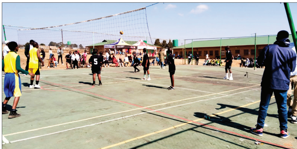
Volleyball teams in action during the Sekhukhune District Volleyball Association League Games held at Matsitsi Primary School in Sterkfontein Village.

Meanwhile holders Orlando Pirates will clash with rivals Mamelodi Sundowns in another titanic semifinal showdown. Pirates defeated Polokwane City 2-0 while Sundowns cruised past Richards Bay 4-0. The semi-finals will be played over two legs. The first legs are scheduled for August 16 and 17, with the return fixtures set for August 23 and 24.