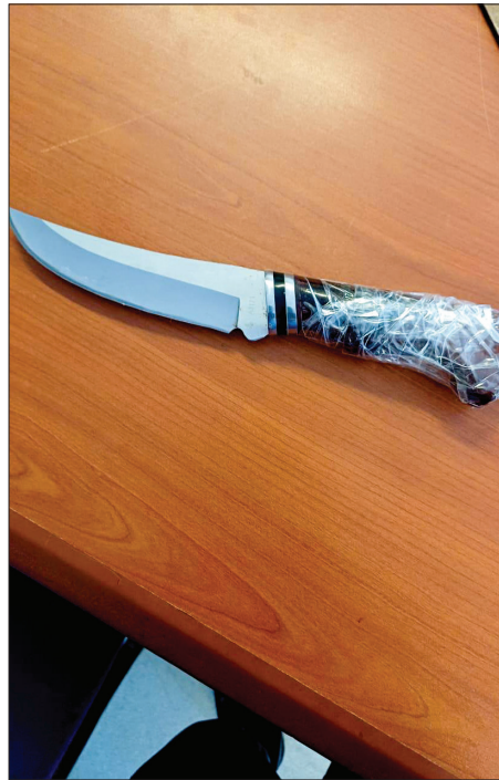
Dangerous weapons including knives were seized by the police during the intensified Operations Sanela conducted across the province.

The Provincial Commissioner of the Police in Limpopo, Lieutenant General Thembi Hadebe, applauded the police in Limpopo for their continuous hard work in ensuring that the province is safe from all forms of criminality.