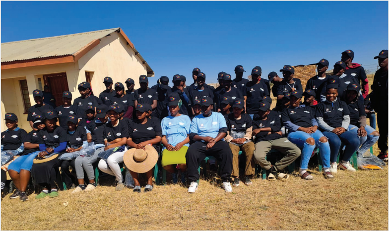
The Ipopeng Cultural Group has successfully launched Youth Projects to uplift young people in Elias Motsoaledi and surrounding municipalities.