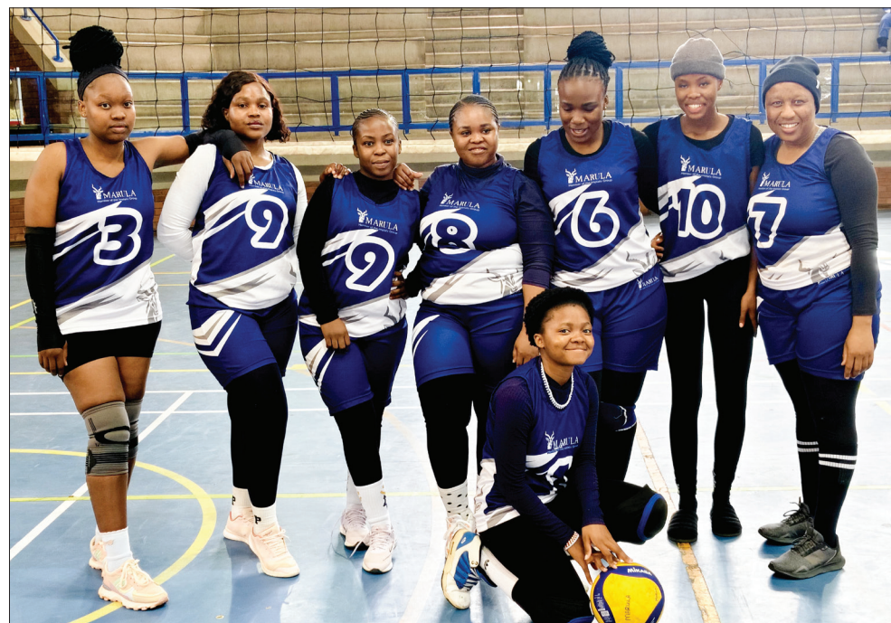
Marula Mine Female Volleyball Team during the Sekhukhune District Volleyball Association League Games at Matsitsi Primary School in Sterkfontein Village.