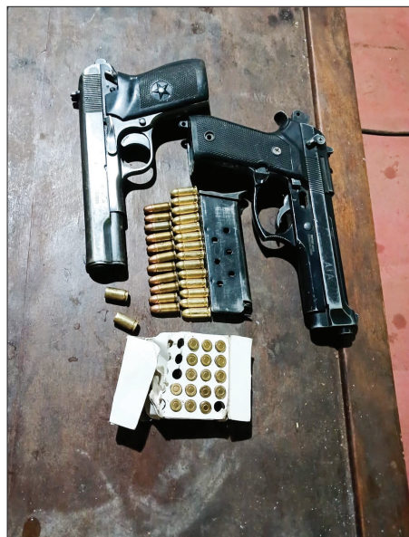
Unlicensed firearms and ammunition were recovered by the police during the operations.