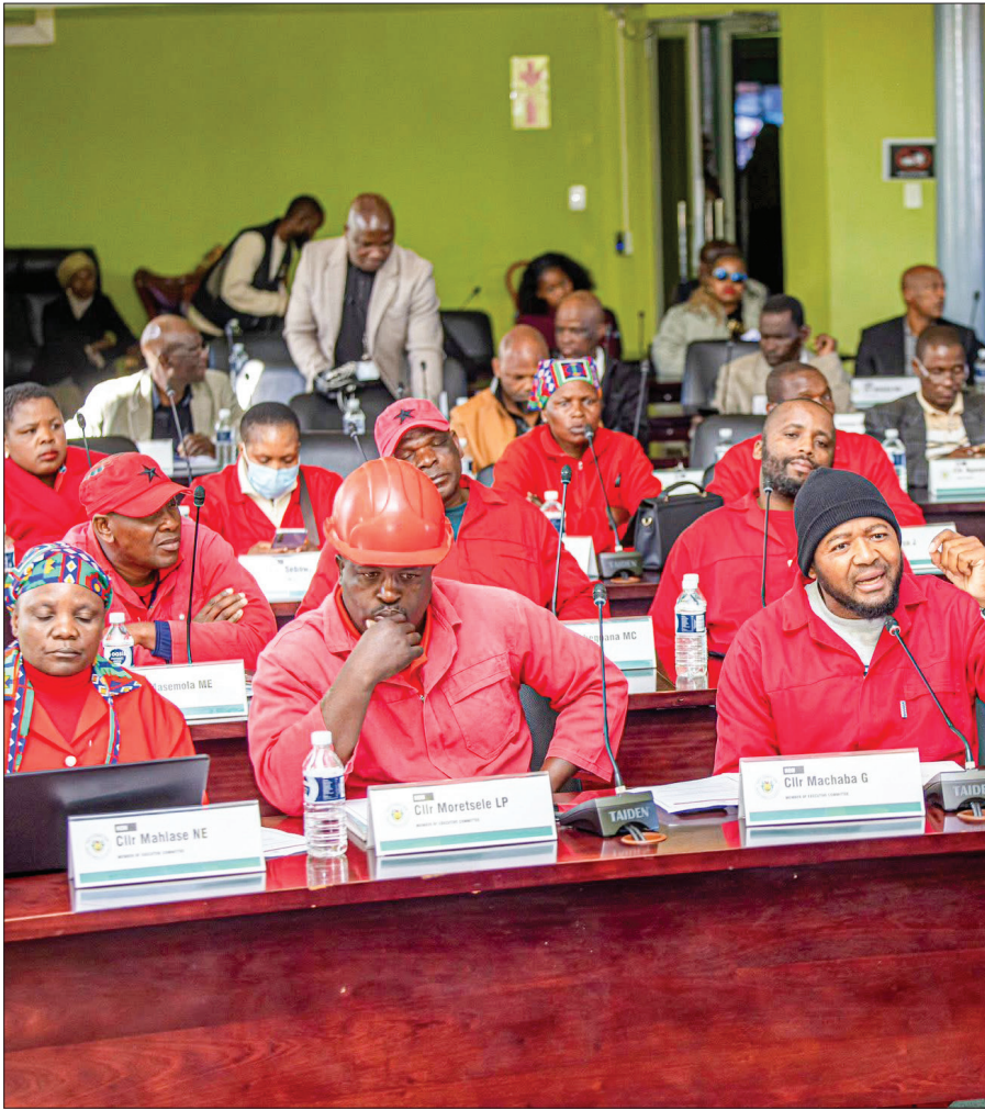
EFF Councillors in MLM were brutally attacked by bouncers during a council meeting for alleged holding the municipality accountable for irregularities.

aligned persons are allowed to operate within and around Jane Furse," Mapoulo stated.