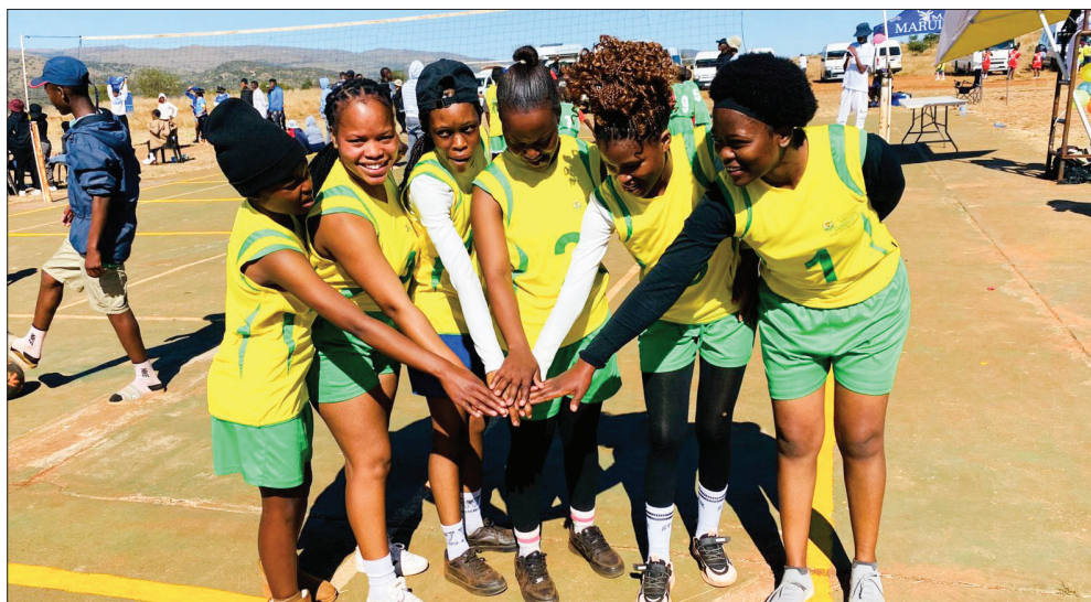
Roosenekal Volleyball Team had an impressive participation at the Sekhukhune District Volleyball Association League Games, held on Saturday 2 August 2025 at Matsitsi Primary School in Sterkfontein Village.