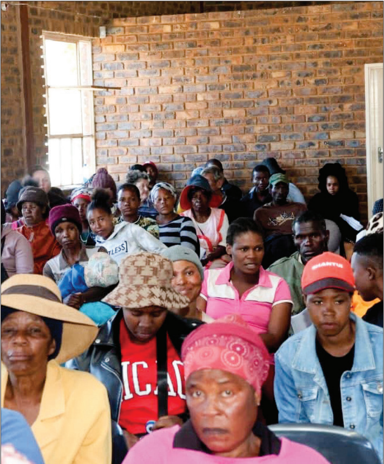
Residents of Roossenekal and surrounding villages came in numbers to attend the commemoration of the World Population Day event.